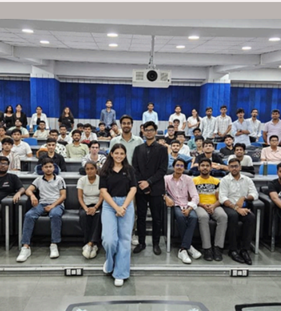
Google Cloud AI Labs' 25