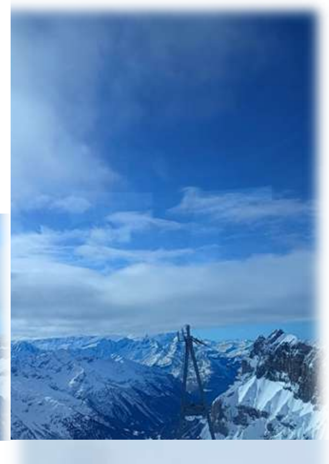
DAY - 13: 12TH FEBRUARY 2023

From Zurich, the student group flew back to India.